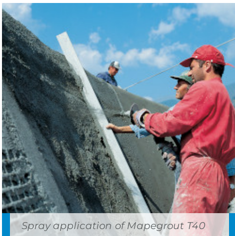
Spray application of Mapegrout T40