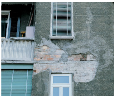
Degraded building façade in need of repair

Coloured Elastocolor Paint may then be applied to create a protective finish.