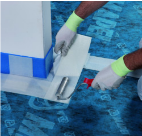
Cut and apply Mapesilent Tape in all the corners and along the overlaps of Mapesilent Band R and Mapesilent Roll around the blended-in areas of Mapesilent Band R to guarantee that the joints are perfectly protected