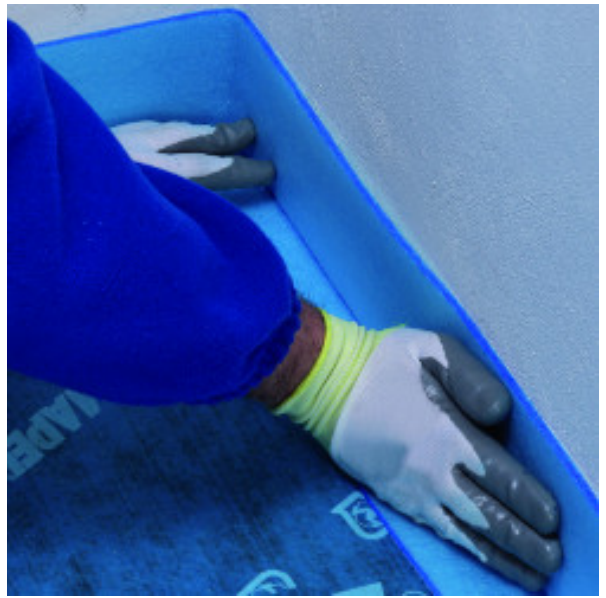
After having removed the protective film from the back, place Mapesilent Band R around all the perimeter of the room