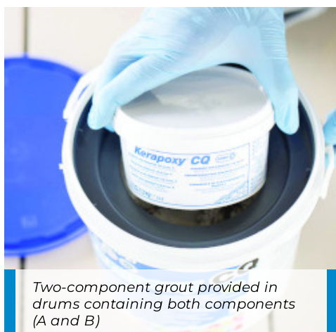
Two-component grout provided in drums containing both components (A and B)

N.B.: Due to the printing processes involved, the colours should be taken as merely indicative of the shades of the actual product