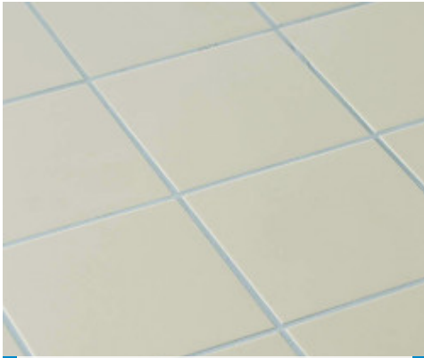
Final effect of a floor grouted with Kerapoxy CQ