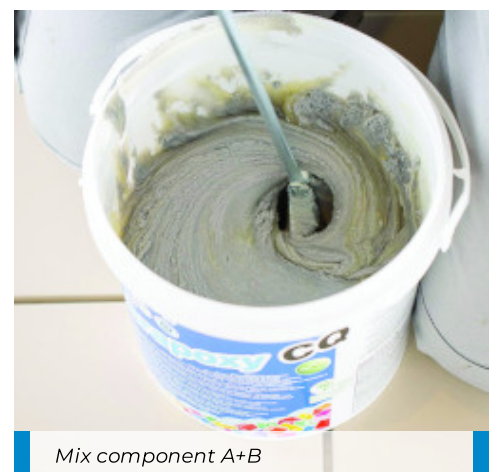
Mix component A+B