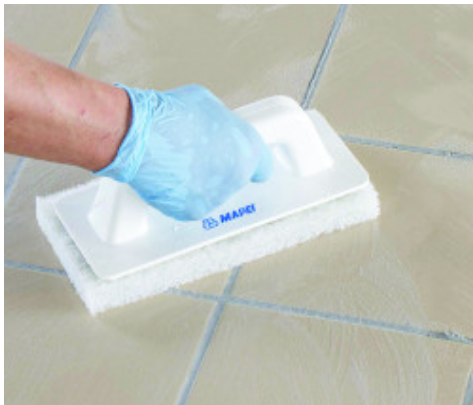
Cleaning joints with Scotch-Brite®