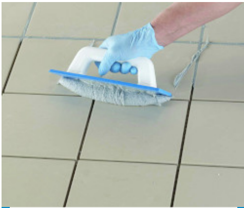
Application of Kerapoxy CQ with Mapei rubber trowel