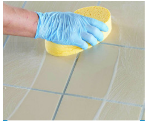
Cleaning and finishing joints with a hard cellulose sponge