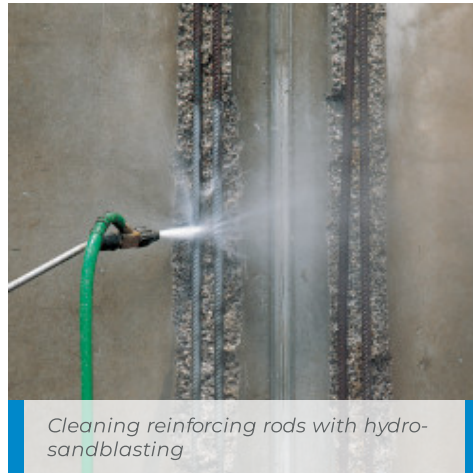
Cleaning reinforcing rods with hydro-sandblasting